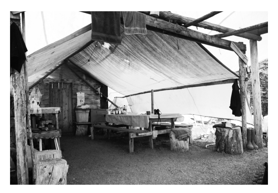
Figure 3. Eating and sleeping areas

Many activities take place in or depart from Arthur's camp. They frequently revolve around hunting. As hunting on Tsētsedle (Klappan Mountain) and elsewhere in the local valleys tends to take place on "bikes" (ATVs), bike maintenance is a constant preoccupation in the camp. I was stunned by the number of tools and the skills of the people in Arthur's camp to dismantle, clean, lubricate, and return to working order this equipment. Hunting from bikes or with the aid of a pickup truck along the rail grade tends to take place in the early morning or in the late afternoon and evening. Hunters paid attention to their watches noting that animals would not be wandering around before 2:30 p.m.