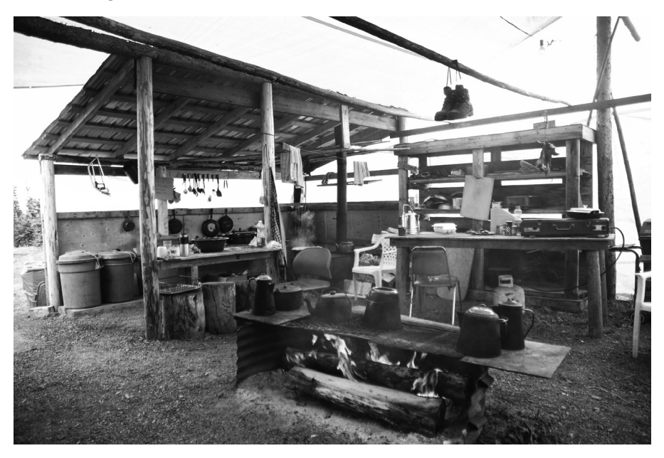
Figure 2. Cooking area with cooking firepit, water pails, and food preparation tables

into the side of a hill. The generator powers lights in the kitchen and cooking areas and, more importantly, runs the freezer in which butchered meat is frozen before it is transported back to the village. Some of these features are visible in figure 1.