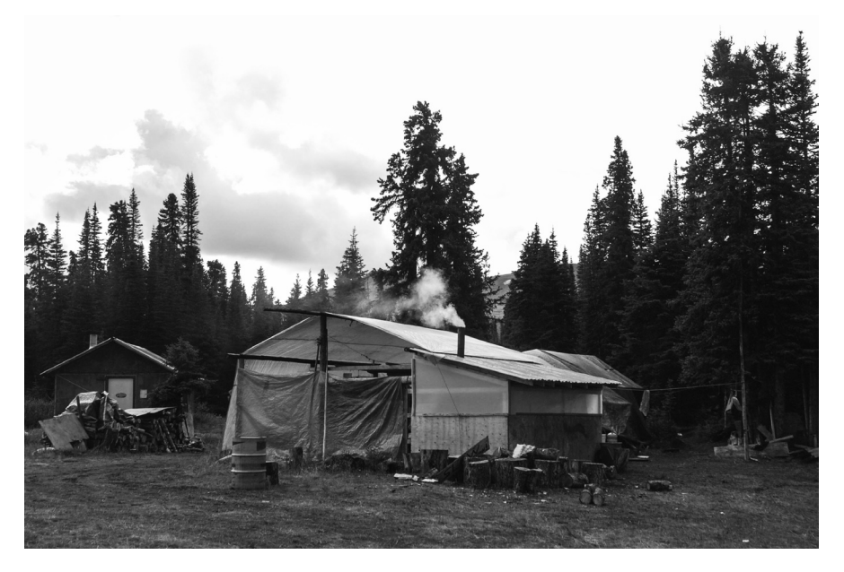
Figure 1. Arthur Nole's Didini Kime showing Arthur's kitchen and sleeping area and an outlying cabin (August 2009)

long (Fig. 1). It is a permanent place. That said, the camp is not a year-round residence. Arthur resides at this camp from early August to early or mid-September each year, although he and his grandsons sometimes visit the camp by snowmobile during the winter. I first camped with Arthur at Didini Kime in August 2002 and then again in August 2004. Since those initial visits, Arthur reconstructed the cooking area using plywood and posts. The new construction replaced a similar area that was covered with a blue tarp; the rebuilding process reminded me that camps are always under construction. Arthur's camp is accessed by a short driveway leading off of the rail grade and up onto an area of level ground near a creek. In a subtle reminder of a previous and aborted era of resource development, the driveway into the camp passes a pit from which gravel was removed to build the rail grade. During my more recent visits, this gravel pit served as a shooting range for young people to sight their rifle scopes.