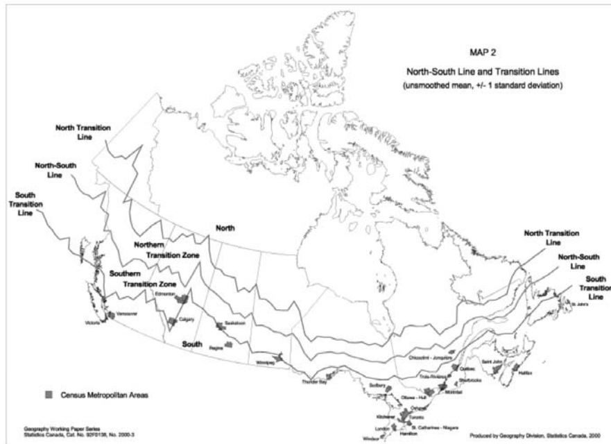
Figure 1. North-South transition lines (Source: McNiven and Puderer, Delineation of Canada’s North: An Examination of the North-South Relationship in Canada , Statistics Canada Geography Division, 2000, 15)

Is the “North” the Taiga Shield alone? In his paper discussing the concepts of rural, the remote, and the north, Pitblado notes the lack of consensus on definitions for any of these terms. 30 Pitblado notes different understandings of the term “North,” including the tendency to push the boundary of the “real” North to the 60th parallel. This boundary corresponds with the boundary of the Taiga plain as an ecological zone. Such a definition considers everything immediately below the Taiga as “south” by default or as some undefined transitional zone; and the rest of the country “below” that in an intermediate north-south terminological limbo. Pitblado notes, for example, that McNiven and Puderer use sixteen climatic, biotic, and socio-economic indicators that put such urban centres as Thunder Bay and Sudbury into the “south,” even below a wide transitional zone. 31 One of McNiven and Puderer’s maps is reproduced below (figure 1).