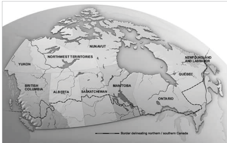
Figure 3. Border delineating northern and southern Canada.