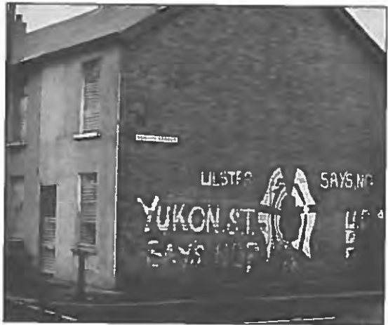
Figure 1 Yukon Street, Belfast, Northern Ireland.

There is a Klondike Street near Edinburgh as well. It is named after the Klondike coal mine, the shaft of which was sunk at