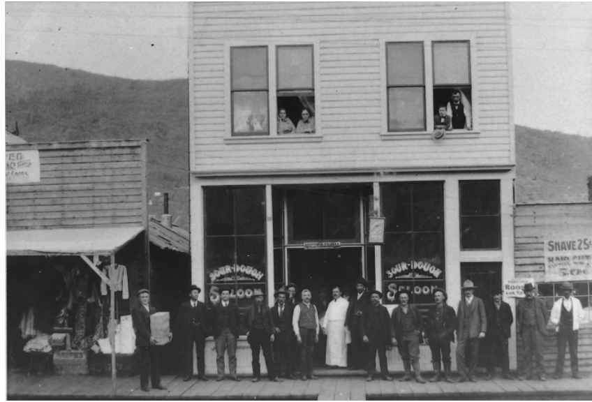
Figure 1. A group of men standing outside the Sourdough Saloon, Dawson, 1900. Also visible are two women, one man, and one child looking from the windows of the hotel above the saloon.