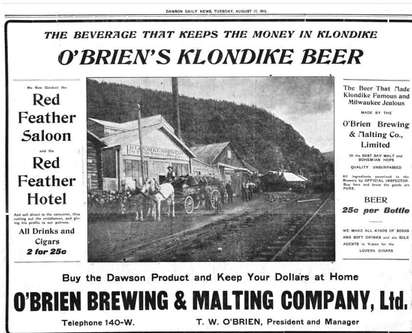
Figure 2. A commonly published advertisement for the O'Brien Brewing and Malting Company. Dawson Daily News , August 17, 1915.