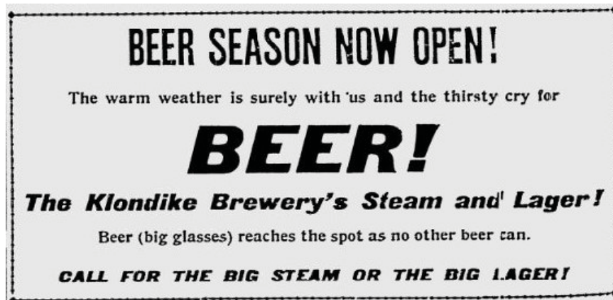
Figure 3. A Klondike Brewery advertisement. Dawson Daily News , May 25, 1905.