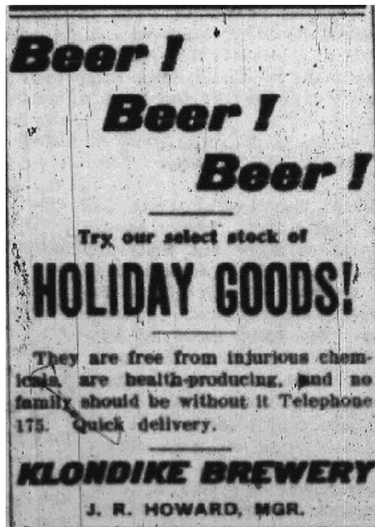
Figure 6. Holiday beer ad. Dawson Daily News , October 24, 1914.