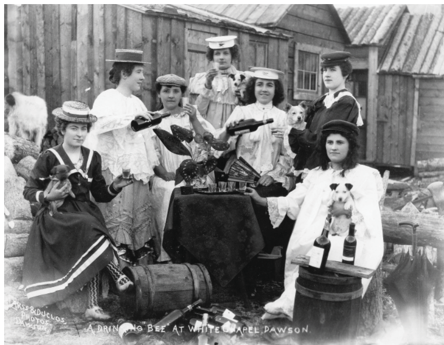
Figure 5. A “Drinking Bee” at White Chapel, Dawson, 1900.