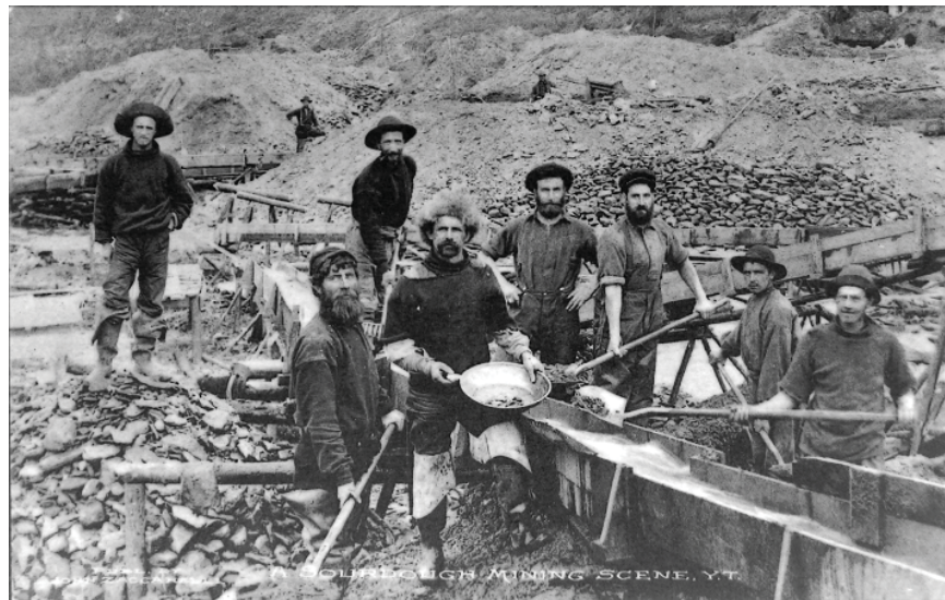
Figure 4. A group of “sourdoughs” in the gold fields, c1900.