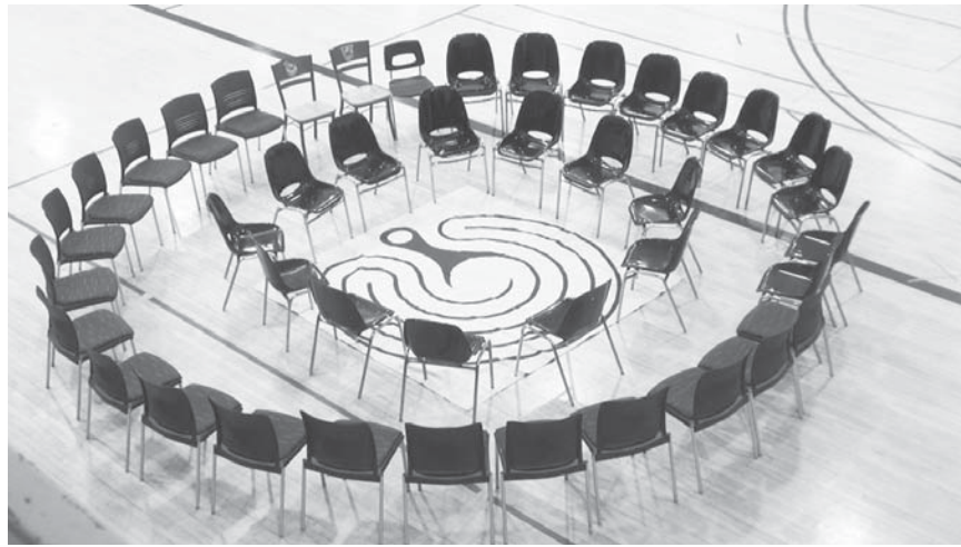
Figure 4. Labyrinth Listening Circle, by Gavin Shields, May 10 2018. Reprinted with permission.

gives participants time and space to wander with their question and to work it through their minds and bodies. We have learned that this is a totally different experience than simply posing a question to a group that remains seated. Time, space, and movement through the labyrinth changes how one processes a question and also changes how one approaches sharing.