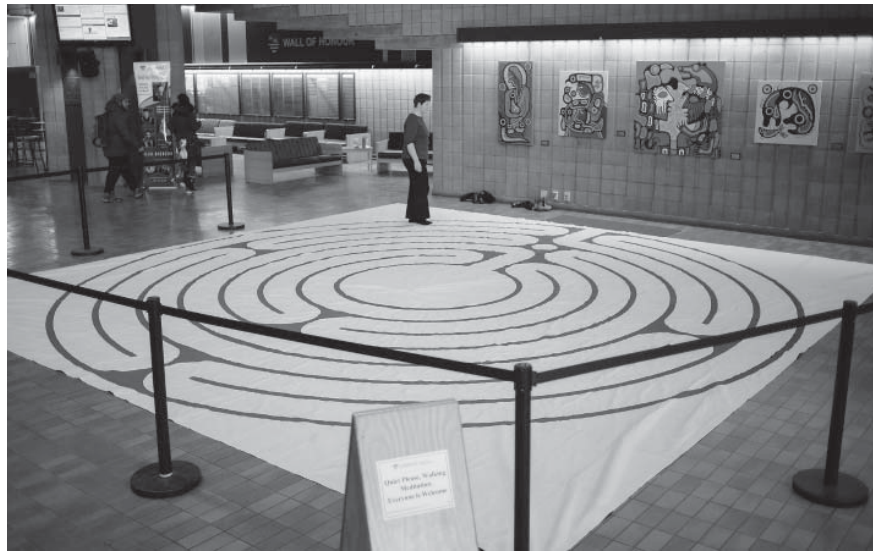
Figure 1. Circle of Peace Labyrinth, by Kay Lee Photography, December 14, 2017. Reprinted with Permission.

In helping to plan for the 2018 Sustainability Workshop, we suggested that we rethink conventional workshop protocols by beginning the day with walking the labyrinth. Workshop organizers agreed to forego the usual introductions and instead first invite participants to consider more deeply why they were there, and what they hoped to contribute. In other words, we decided to ask participants to consider the deeper nature of their work, and their own power to, in White's words, "shape the place where the self meets the world." Our rationale for this intentional interruption of business-as-usual at an academic gathering was to set the stage for a more contemplative appreciation of the northern context and what it actually means to diverse participants. Understanding places in the North means understanding that no place is ever one place: it is the shifting interplay of how people experience it and act upon it. Just like an individual person, part of a place is always changing, while other parts of it endure (Greenwood, in press). We wanted a process that illustrated the diversity and complexity of northern places from the beginning of our interactions together. While the workshop as a whole was regionally specific, it should be noted that the methodologies described below are transferable to any place where people are willing to walk and talk together. Their purpose, that is, is to