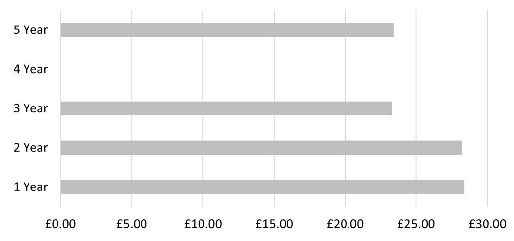
Figure 2.Average HBC payment in £ Sterling, per length of fishing contract, 1823–1888.