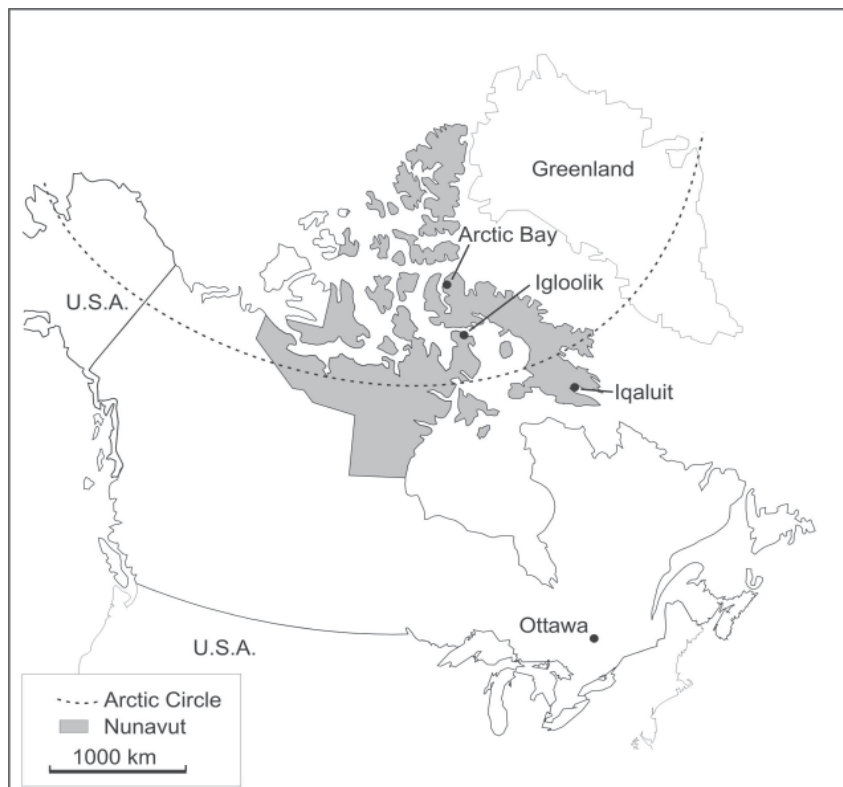
Figure 1. Location of Arctic Bay and Igloolik

char ( Salvelinus alpinus ), polar bear ( Ursus maritimus ), and caribou ( Rangifer tarandus ) are the mainstays of the wildlife harvest (NWMB, 2004) (table 3). Mainstays in Igloolik include walrus ( Odobenus rosmarus ), polar bear, ringed seal, caribou, char, and a variety of migratory birds during spring and summer (NWMB, 2004) (table 3). Except for the summer open water period, travel and harvesting in both communities are largely performed on sea ice. As highlighted in table 3, important differences in harvesting activities are also evident. Iglulingmiut (Inuit from Igloolik), for example, hunt walrus from the moving ice in winter, and offshore amongst the loose pack ice during summer, while there are few walrus in the Arctic Bay region.